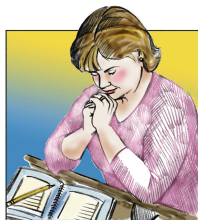
Pray Without Ceasing